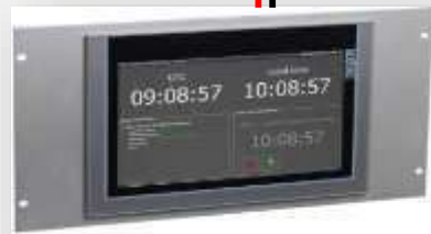
Programable Control panel