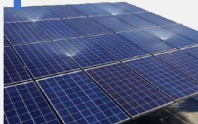
Solar panels with Sprinkler